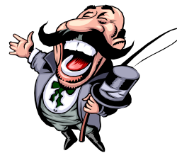
Sunday's have never been so fun!

We have a passion for the Lord and a love for each other. We have compassion for children and for people that are seeking a deeper relationship with God. And we are hungry to do something significant for God.